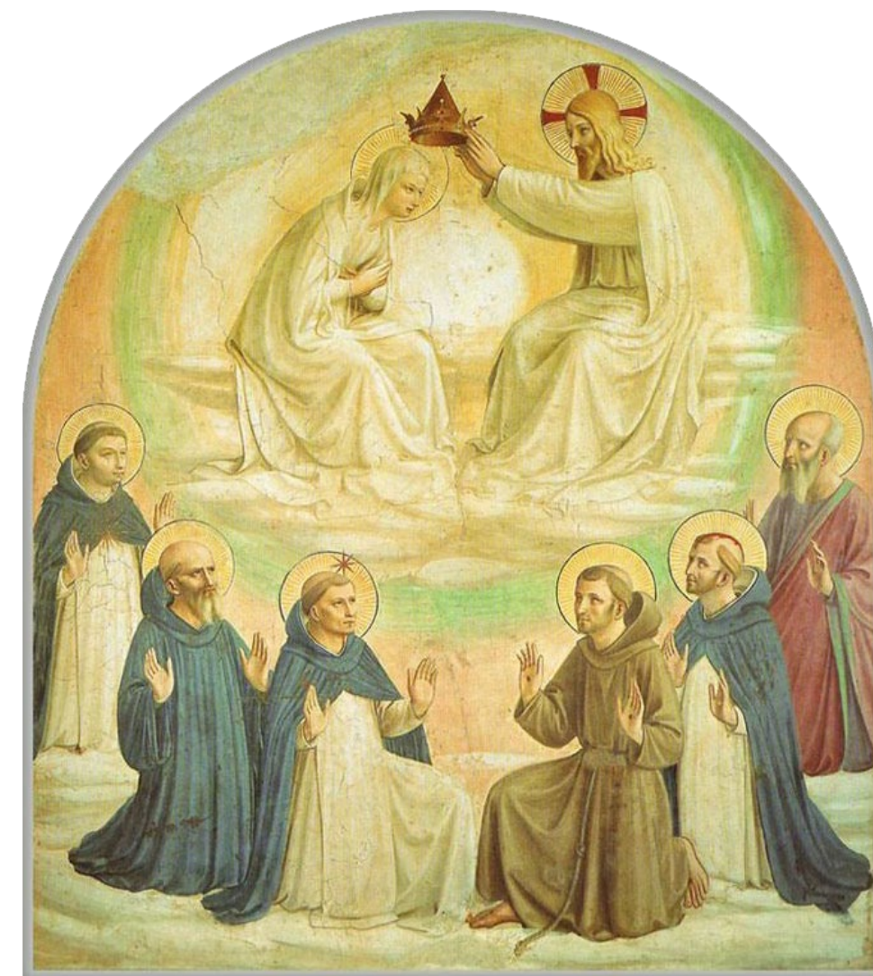
Fra Angelico, Coronation of the Virgin. Convent of San Marco, Florence (1439-43).

This conference has been made possible through the generous support of several institutions and partners in both Europe and the United States. Our American partners include the Office for Academic Affairs and the Graduate School of The University of Alabama, the Capstone International Center, the Alabama Water Institute, the College of Arts and Sciences, and many of its departments (History; Modern Languages and Classics; English; Religious Studies) and programs (University Museums; Medieval and Early Modern European Studies; the Hudson Strobe Program in Renaissance Studies; the Summersell Center and the Summersell Chair of Southern History; Latin American Studies; Asian Studies; Diversity Committee; University of Alabama Press). We also thank our many civic partners, which include the City of Tuscaloosa, the Rotary Club of Tuscaloosa, and several private donors, including the members of the Emeriti Committee for International Strategic Studies. And we are most grateful for the support of our European partners, which include the Research Centre for the Comparative History of Religious Orders (FOVOG) of the University of Dresden, the Graduate School of Interreligious Studies of the University of Dresden, and the Saxon Academy of Sciences (Leipzig).