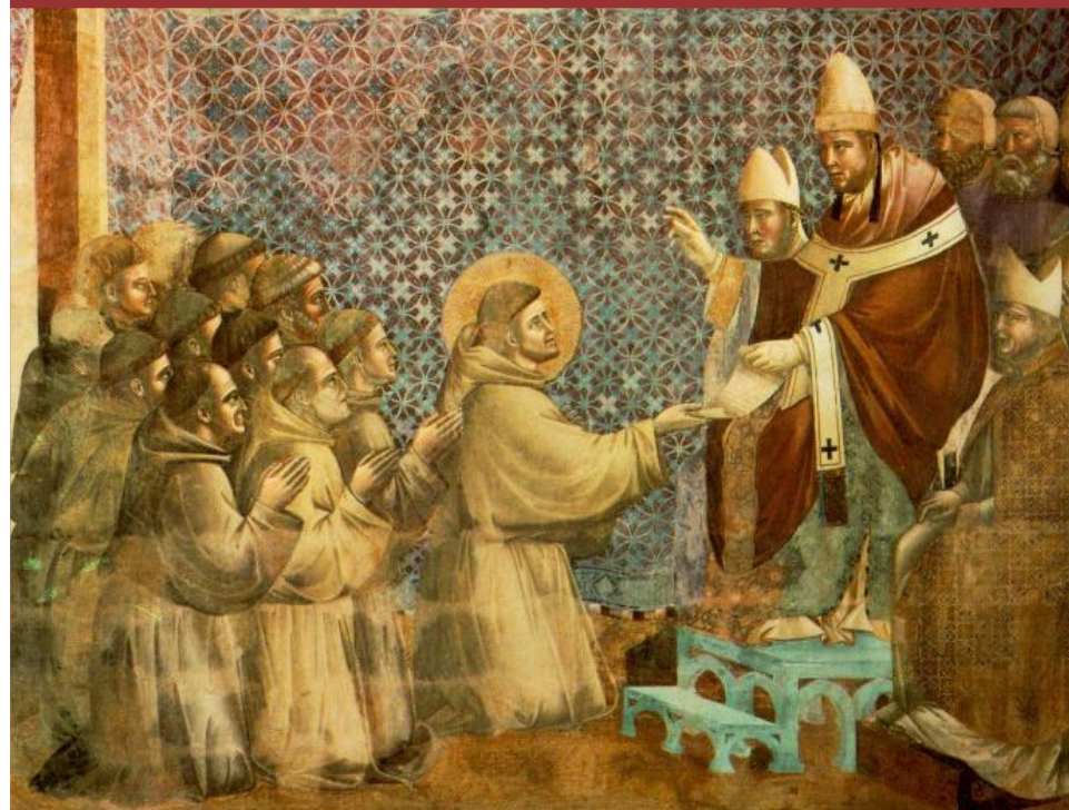
Giotto, Pope Innocent III approving Rule of St. Francis. Basilica di San Francesco, Assisi (1296).

visittuscaloosa.com visitbirmingham.com tourwestalabama.com